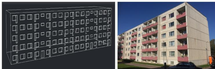
Fig. 1 Building model used in simulation

The modelling project was a five story dormitory building located in Riga, Latvia. A building model used for comfort and energy simulation with software "Riuska" is presented in Fig. 1.